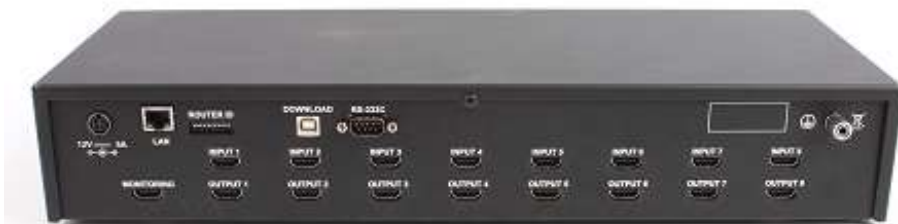
<Rear Panel of OHM-88>