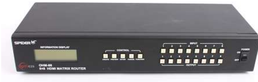
<Front Panel of OHM-88>