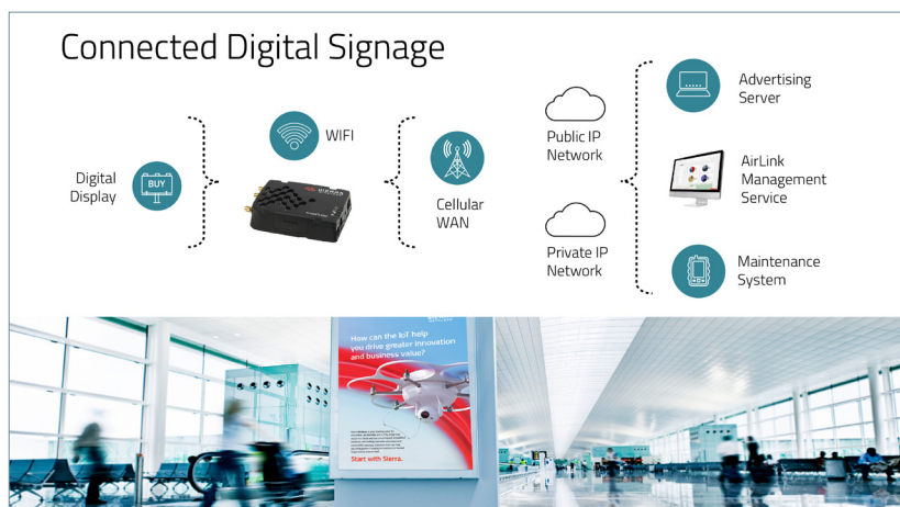
Application Example - Digital Signage