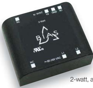
2-watt, actual size

85 to 265 VAC Modular Switching Power Supplies -30° to 70°C Starting and Operating Temperature