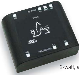
2-watt, actual size

85 to 265 VAC Modular Switching Power Supplies -30° to 70°C Starting and Operating Temperature