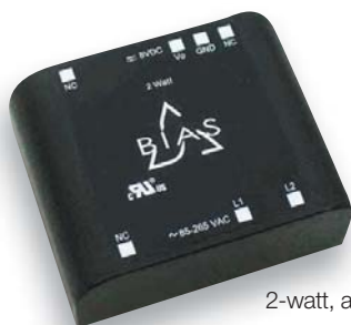
2-watt, actual size

85 to 265 VAC Modular Switching Power Supplies -40° to 85°C Starting and Operating Temperature