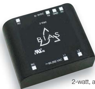
2-watt, actual size

90 to 308 VAC Modular Switching Power Supplies -40° to 85°C Starting and Operating Temperature