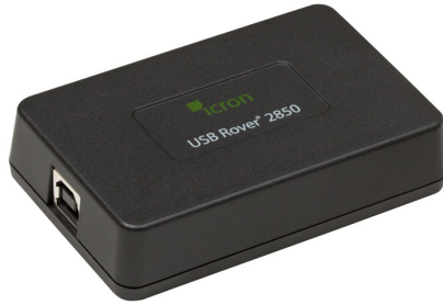
Local Extender (LEX)

The USB Rover ® 2850 extends USB connections beyond the desktop up to 40 meters (85 meters achievable with some Low-Speed HID devices such as keyboards and mice).