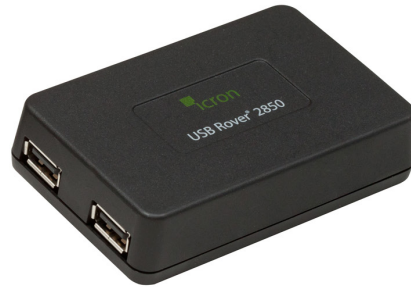
Remote Extender (REX)