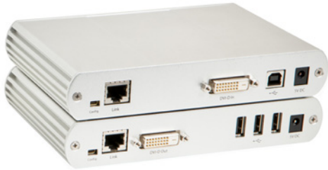
Rear views of LEX (top) and REX (bottom)