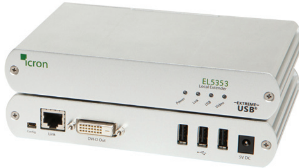
LEX (Local Extender) front view

The EL5353 KVM Extender System features the latest and most robust HD video and USB extension technology from Icron Technologies. The EL5353 extends both DVI and USB 2.0 applications up to 100m over a single CAT 5e/6/7 cable.